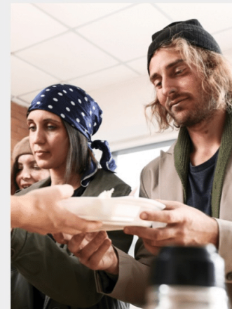
Poverty Awareness Month