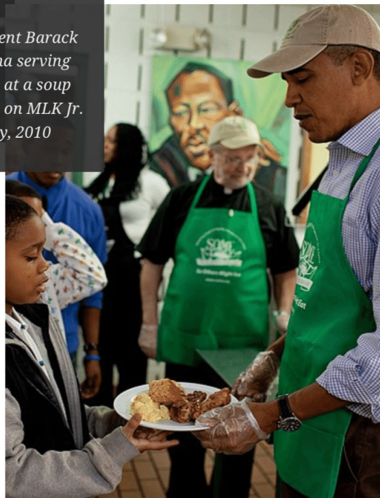
President Barack Obama serving lunch at a soup kitchen on MLK Jr. Day, 2010

Martin Luther King Jr. Day (Jan. 16) is a federal holiday in the United States, which honors King as the chief spokesperson for nonviolent activism in the Civil Rights Movement.